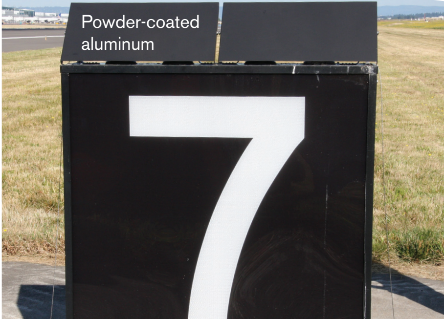
Distance to go sign