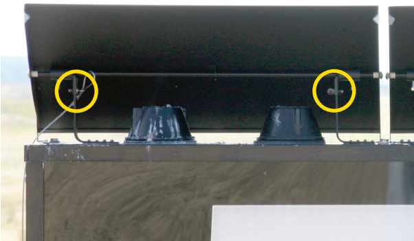
Remove the thumb screws and the Tilt lifts off for maintenance.