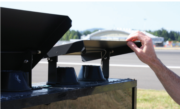
Rotates on bird's landing