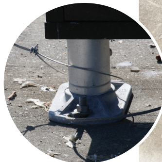
Tethered for safety